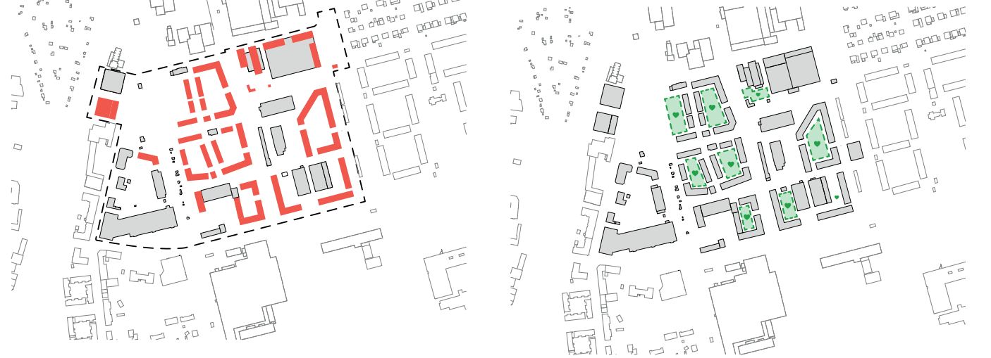
New added structures New housing and other structures are added to make the area an attractive and vibrant neighbourhood.